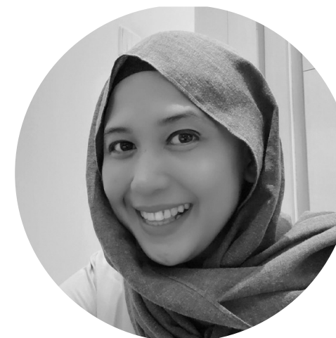
Yasmina Hasni, Indonesia

Rose is a community climate advocate, promoting gender friendly climate resilience initiatives in Kenya and across East Africa. She co-founded two women led organisations - Women in Water and Natural Resources Conservation in Kenya and Women's Climate Centers International across East Africa. Through the two organizations Rose has mobilized and formed a network of women climate accelerators through the establishment of community climate centers. These centers bring men, women, boys, girls, and families together to address climate related challenges and build a sustainable future.